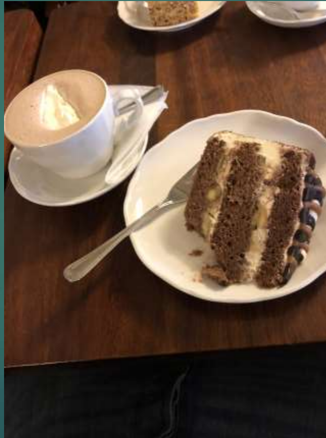
There local cheese cake