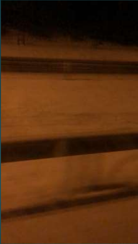
A blurry picture of snow on the highways

We had to leave Gozo at 1 in the after noon. The flight was at 5 and we arrived there at 1 in the morning. These are some pictures in the Finland airport and on the highways of Finland