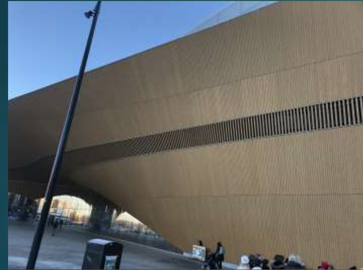
The library from the front