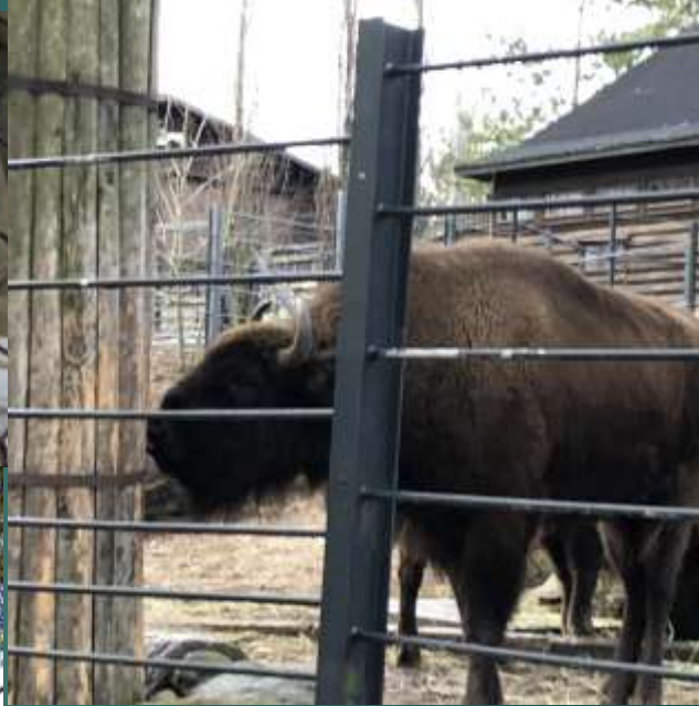
Some animals that were in the zoo.