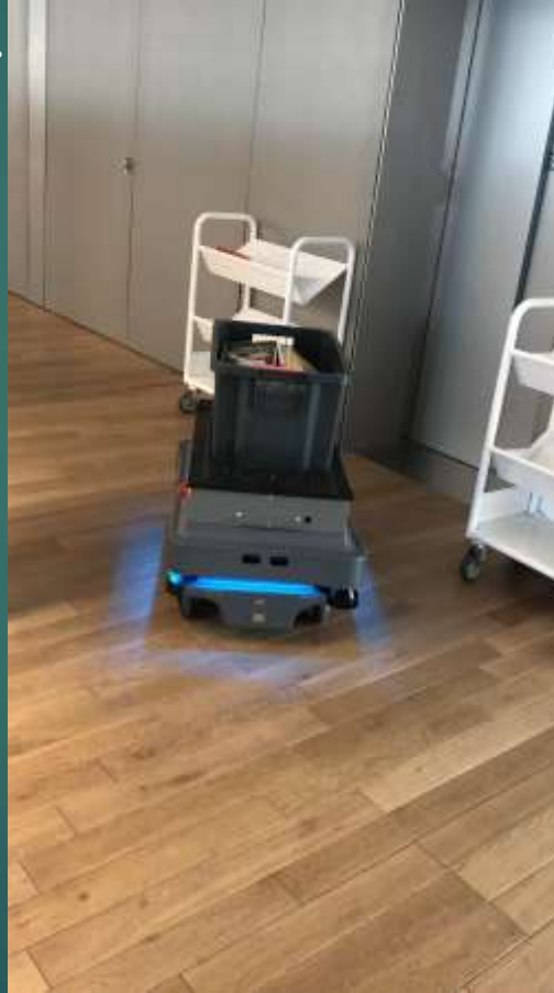
The sorting system of the library