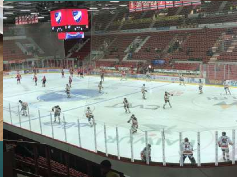
The warming up before a hockey game