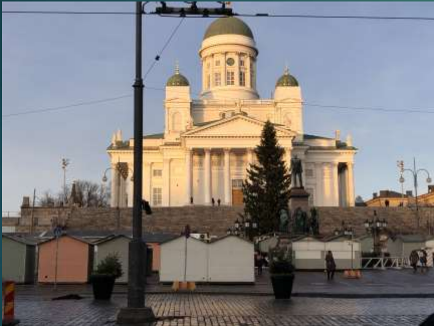
The catholic church and the small huts were suppose to be the Christmas market but it was closed and it will open on Friday the day we left