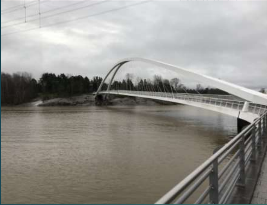
The bridge we had to cross to go to the zoo