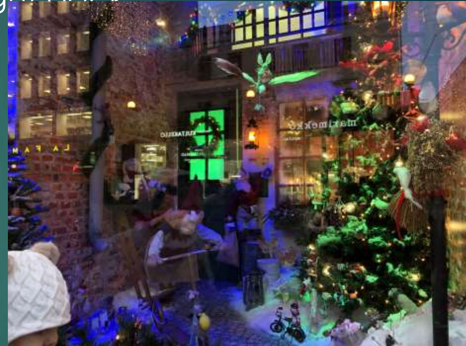
The Christmas shopping mall