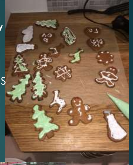
Some cookies we baked